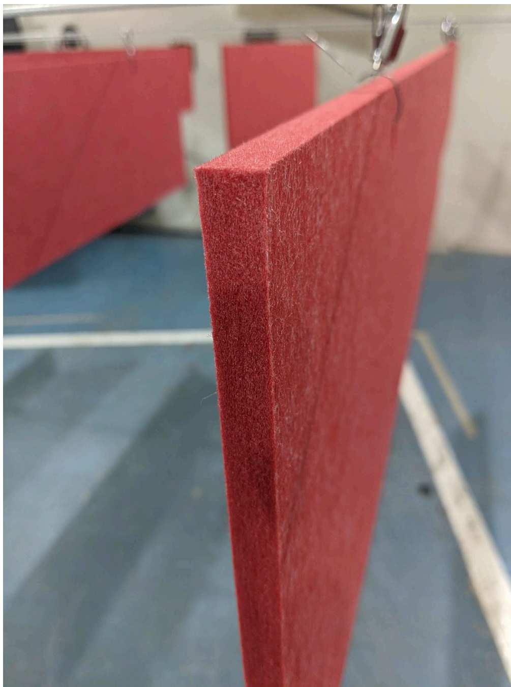
Figure 3 – Detail of specimen material